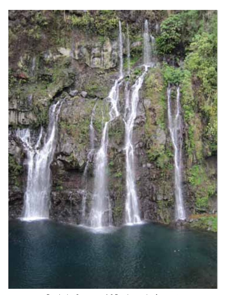
Bassin des Cormorans à 3 Bassins sur la côte ouest de l'île de la Réunion